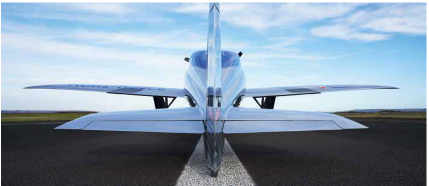
Figure 8: Rolls Royce's Spirit of Innovation, holder of the all-electric world air speed record

Airspace modernisation will be critical to achieving both our Jet Zero and aviation innovation ambitions, and has an important role to play in helping to meet decarbonisation targets. It will also ensure new and current airspace users can effectively operate in UK airspace, and deliver quicker, quieter and cleaner journeys.