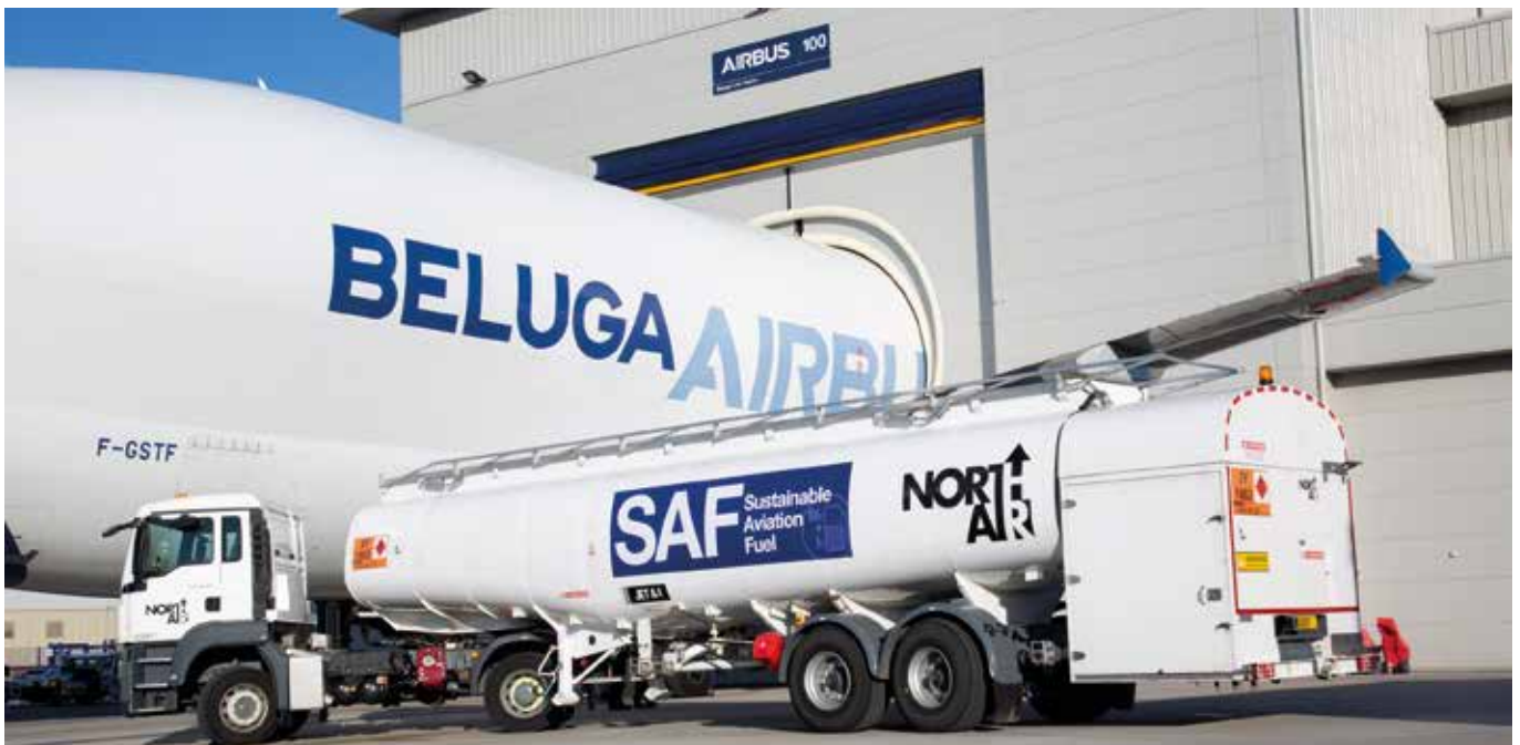
Figure 9: Airbus