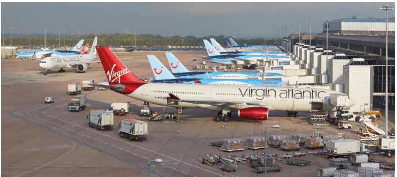
Figure 7: Aircraft at airport terminal, Manchester Airport.

Equally, it is critical that the existing capacity of airports is managed as efficiently as possible. Airport slots are used to manage capacity at eight of the busiest airports in the UK. The airport slot allocation system is key to the successful functioning of these airports, as well as the efficiency and competitiveness of the aviation sector as a whole. The current slot allocation system was devised in the early 1990s, at a point at which demand was growing quickly and the amount of available capacity at certain airports was being rapidly filled. Some airports are now effectively full, and therefore newly available slots at some slot-coordinated airports have become a rarity, creating a barrier to competition and new entrants to the market.