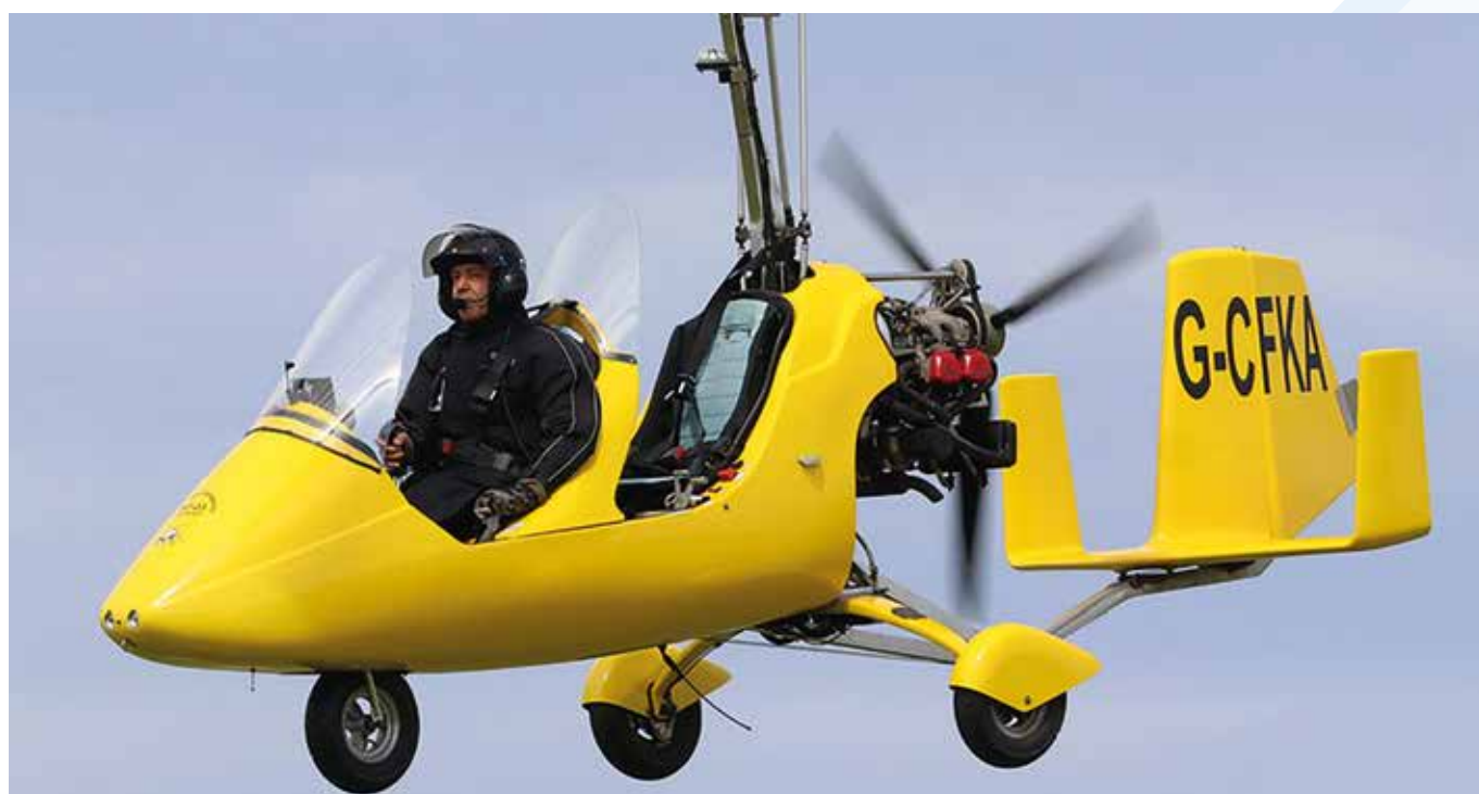
Figure 15: A RotorSport UK aircraft in-flight at a Light Aircraft Association Rally 2019.

We will continue to support effective representation of GA in airspace policy to ensure the needs of existing and future GA users continue to be considered as part of