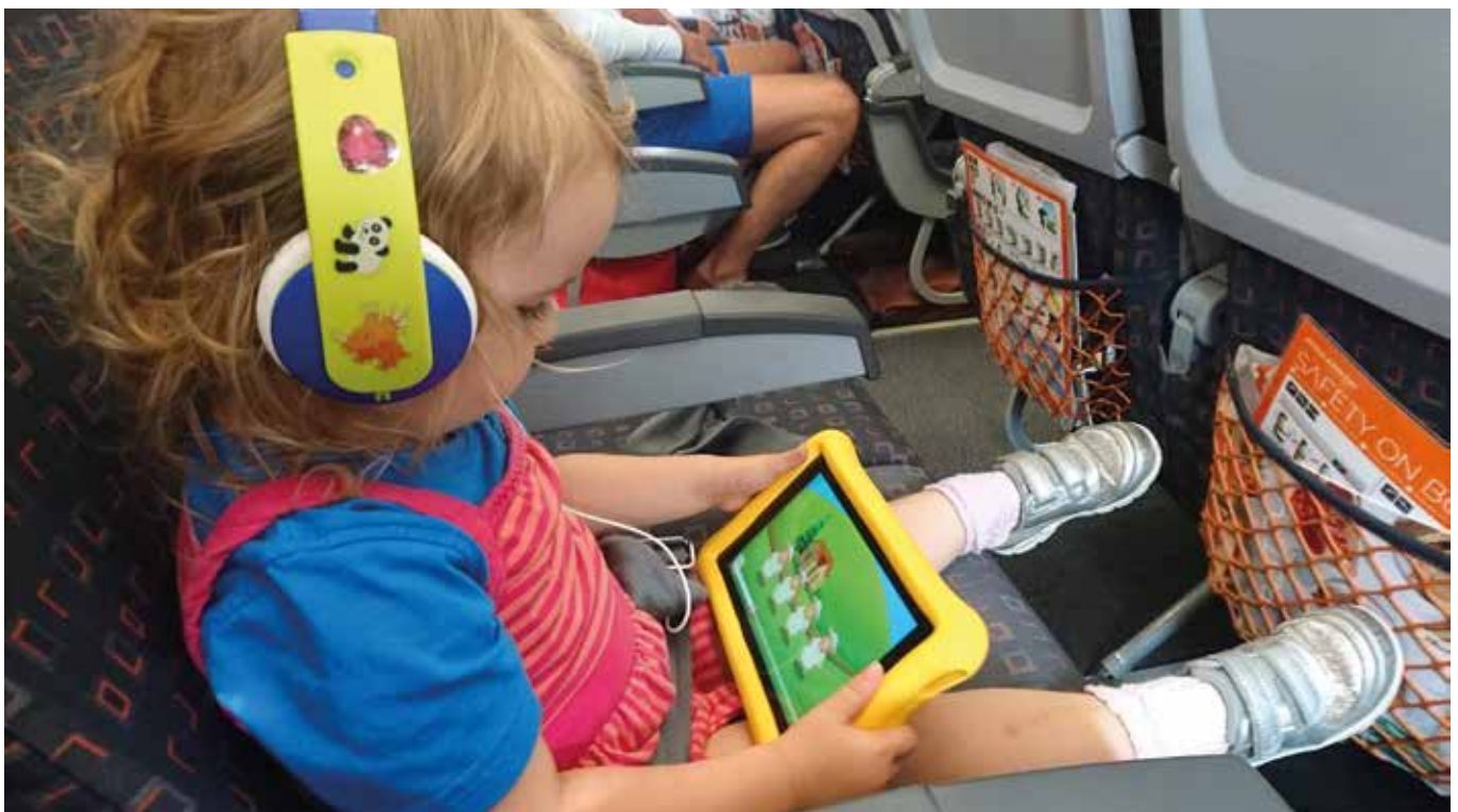
Figure 16: Child onboard an Easyjet flight from Gatwick to Jersey with tablet, DFT.

In delivering for consumers, we need to also continue to maintain our world-leading standards on safety and security, which represent the foundations of secure travel. This will include regularly modernising and adapting our approach to safety to ensure it continues to meet the needs of the sector and consumers. We also need to ensure our security activity always stays ahead of the threats to aviation to protect the UK and continues to promote the most effective security standards globally.