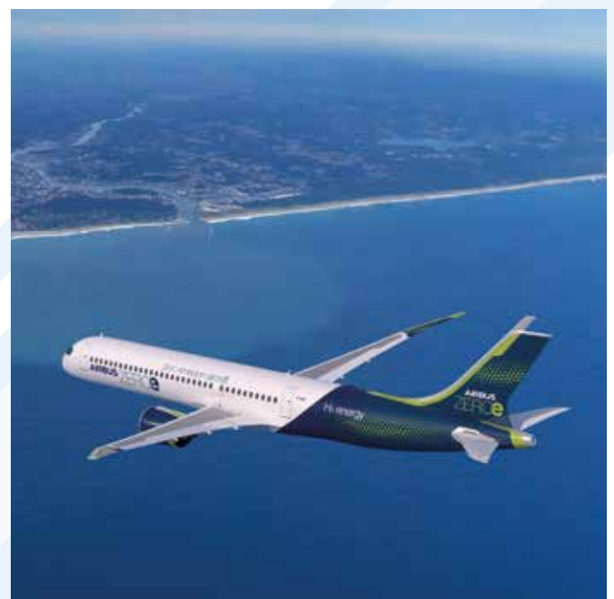
Figure 10: ZEROe, Airbus

These included a clearer noise policy framework alongside measures to incentivise best operational practice to reduce noise and measures to improve airport noise insulation schemes. As the sector recovers, and air travel volumes increase again, these aims remain very relevant and we will set out next steps in 2022/23.