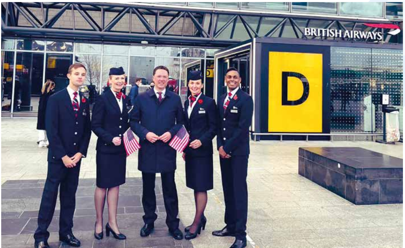
Figure 6: Minister for Aviation, Robert Courts, with the flight crew of first transatlantic flight since the pandemic, Heathrow Airport.

Reopening international travel – ICAO has played a critical role in supporting global engagement on COVID-19 and international travel. The safe and resilient restart of international travel requires global cooperation and solutions and we continue to work through ICAO to facilitate this. As a key contributor to the ICAO Council's Aviation Recovery Task Force (CART), we have helped to steer the work to develop recommendations and guidelines on international aviation restart. At the recent ICAO High Level Conference on COVID-19 recovery, the UK pushed strongly for the harmonisation of global travel rules. This is evidenced by the Ministerial Declaration and Voluntary Charter, both of which are supported by the UK. As we look ahead, and seek to learn global lessons