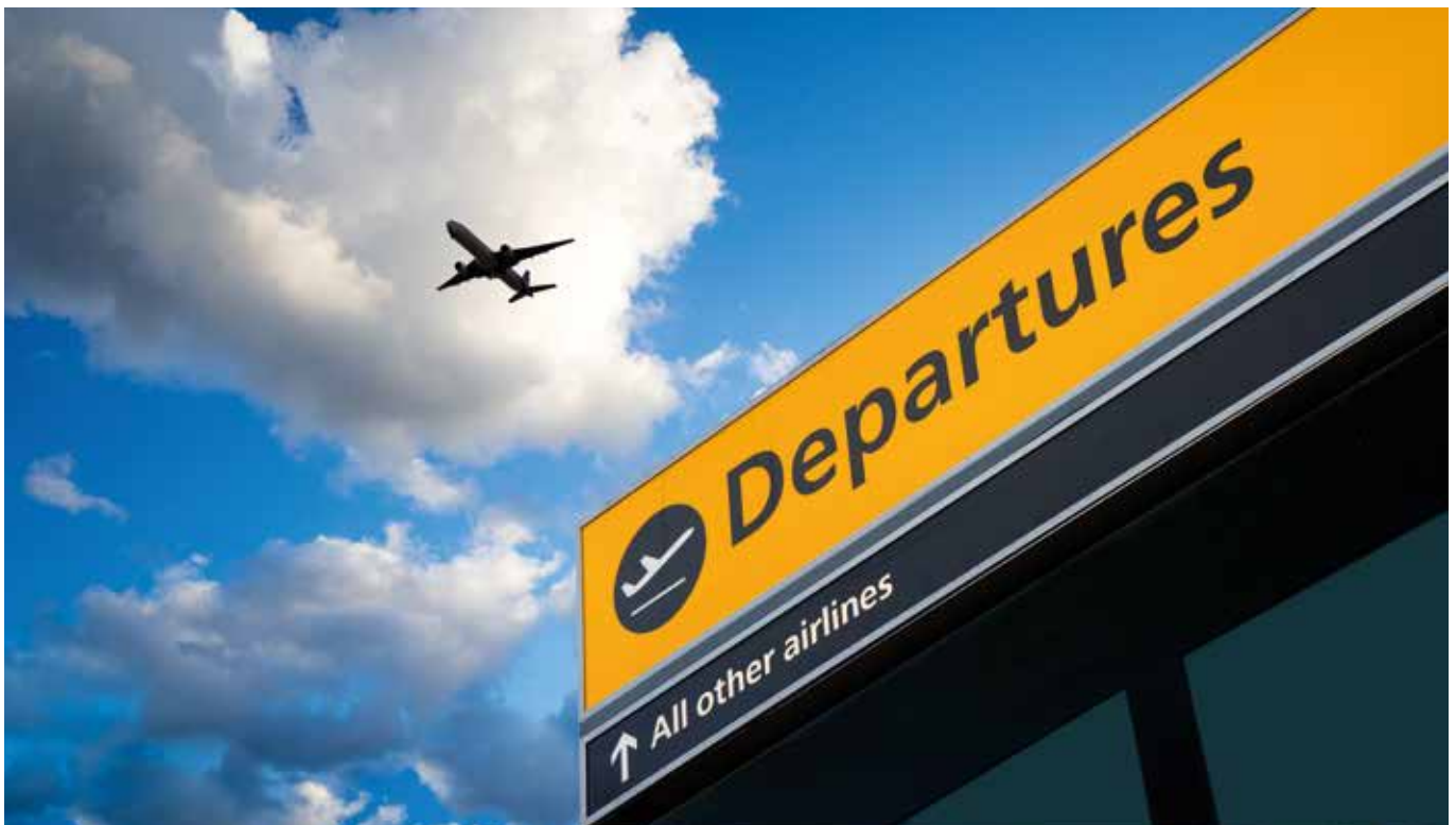
Figure 3: Aircraft flying over a departures sign.

It is also essential that we utilise existing airport capacity in a way that delivers for the UK, putting the needs of users first and supporting our aims to enhance global connectivity. A competitive, modern, and efficient sector for the future, that makes the best use of capacity, will be delivered through recognising where changes may be needed and taking steps to address this. This will include consulting on possible reforms to the slot allocation system.