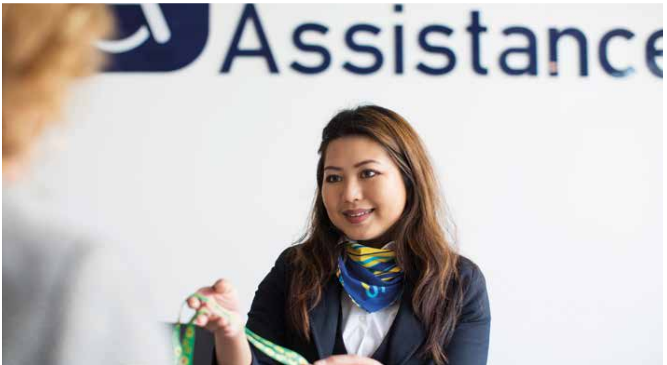
Figure 17: Passenger receiving a 'special assistance card' at Bristol Airport, which helps airport staff identify passengers who may need additional support or assistance as they travel through the airport, Bristol Airport.

In order to deliver effectively for consumers, Government and industry need to collaborate to provide clear, concise information. Engagement