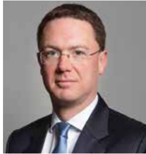
Robert Courts Minister for Aviation

From its earliest beginnings a century ago, commercial aviation has been fundamental to the growth and prosperity of the UK. Today, by providing fast, direct links to hundreds of destinations worldwide, it has helped make us one of the world's best-connected and most successful trading nations, and among the ten most visited countries globally.