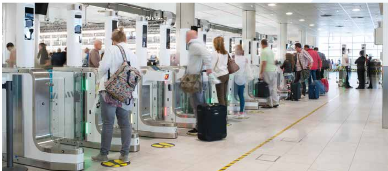
Figure 18: Passengers at North Terminal security E-Gates, Gatwick Airport.

A key ingredient will be efficiency of the processes at the border. Through joint working, all those involved can create a highly digitised and automated border to significantly increase productivity and enable swift and secure clearance for goods and people.