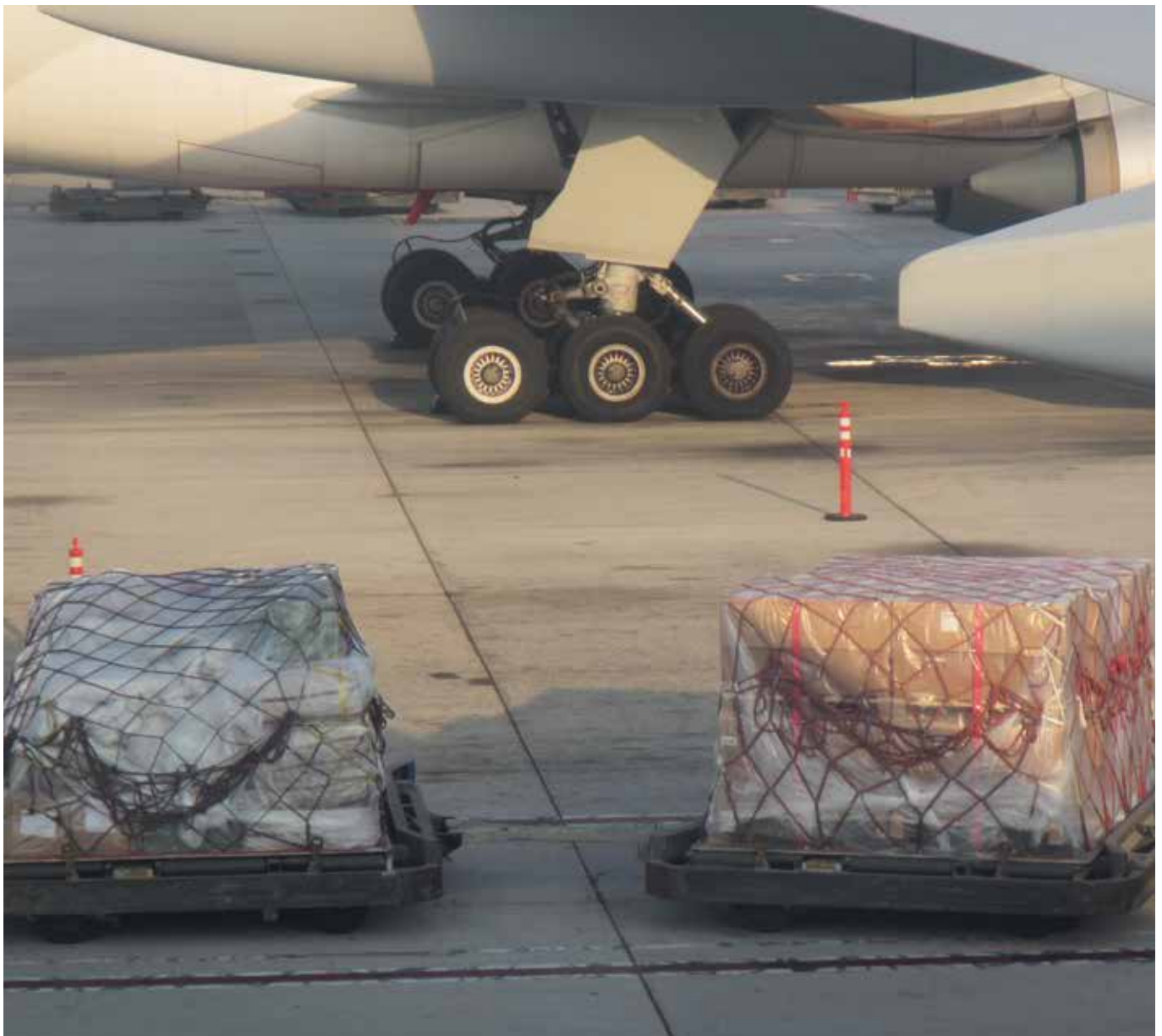
Figure 5: Aircraft and cargo at airport, CAA.

The Jet Zero Strategy, which we aim to publish later this year, will set out the Government's plan for the sector to reach net zero aviation – or Jet Zero – by 2050. This follows a recent consultation on our vision for Jet Zero, focused on the rapid development of technologies to ensure that air travel remains very much part of the UK's economic future.