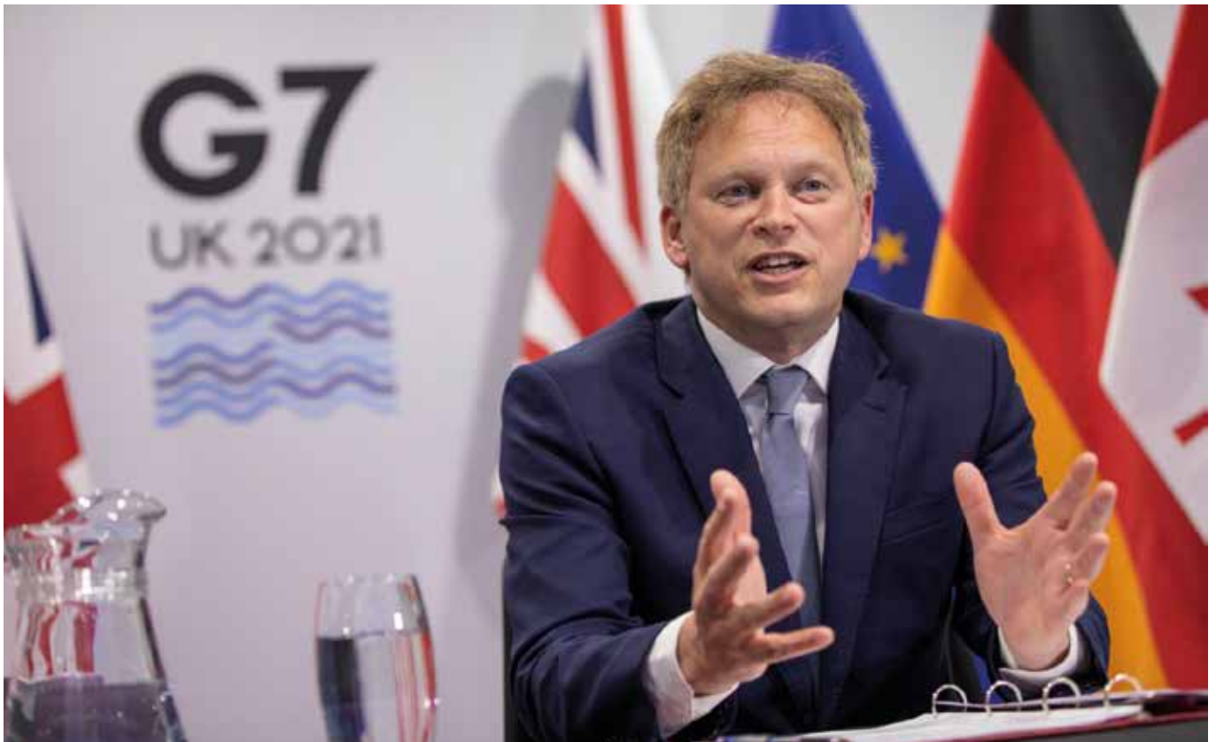
Figure 2: Secretary of State for Transport, Grant Shapps agrees high-level principles with G7 leaders to support international and transatlantic travel, DFT.