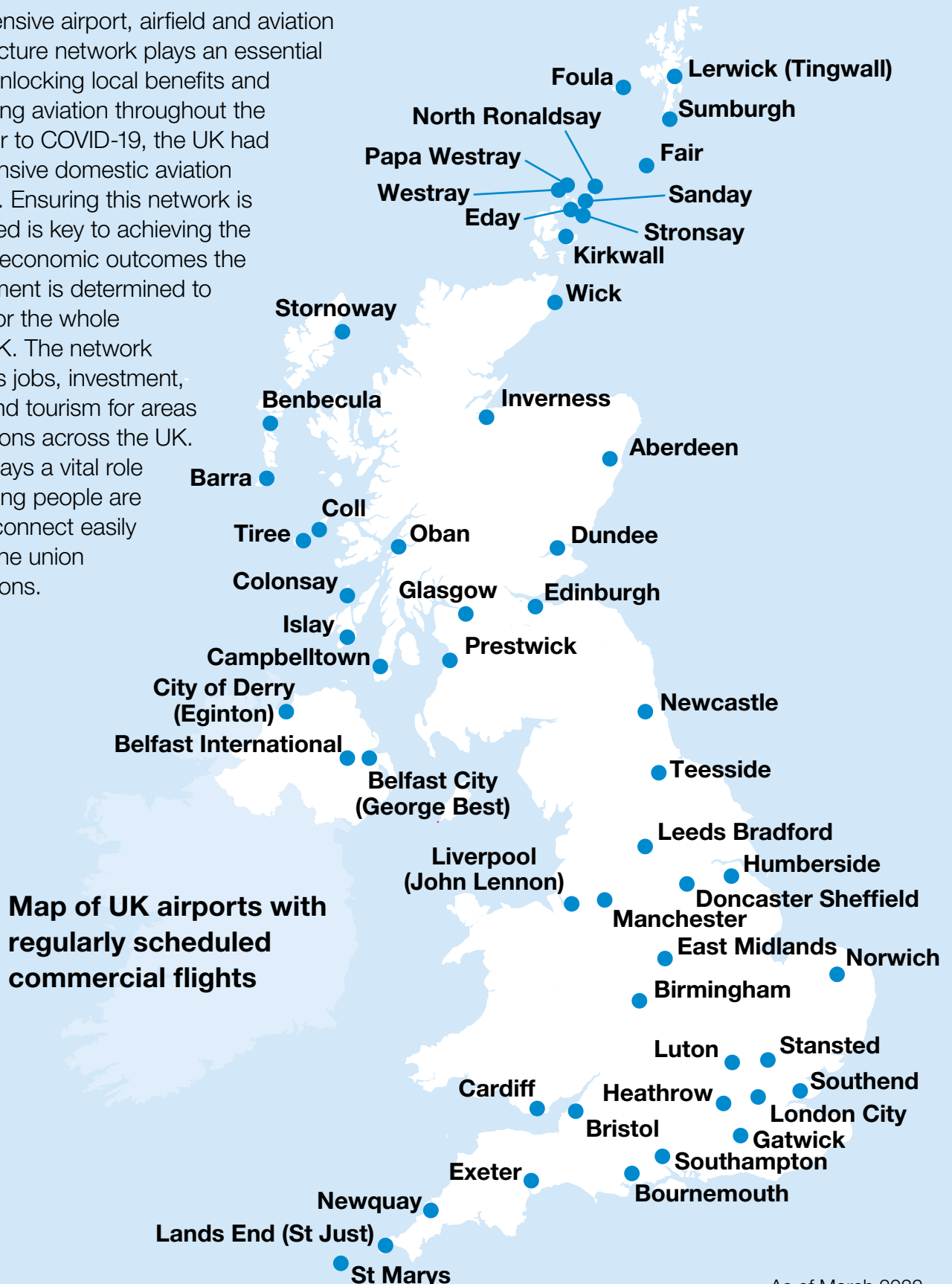
Map of UK airports with regularly scheduled commercial flights

Our extensive airport, airfield and aviation infrastructure network plays an essential part in unlocking local benefits and supporting aviation throughout the UK. Prior to COVID-19, the UK had an expansive domestic aviation network. Ensuring this network is supported is key to achieving the positive economic outcomes the Government is determined to deliver for the whole of the UK. The network supports jobs, investment, trade, and tourism for areas and regions across the UK. It also plays a vital role in ensuring people are able to connect easily across the union and regions.