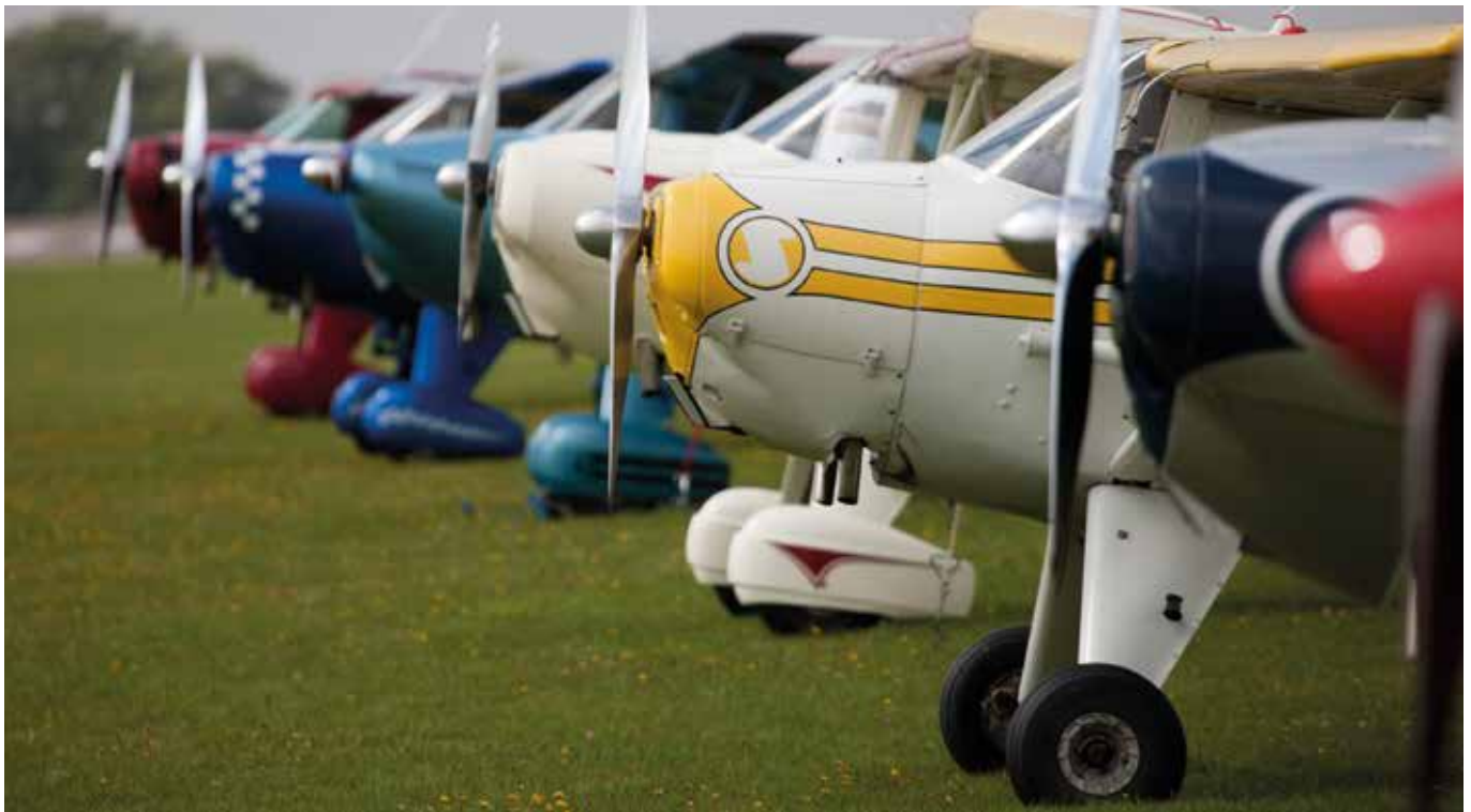
Figure 14: Multiple GA aircraft on display at an airshow, CAA.

These are just some of the significant and exciting future opportunities for GA to drive