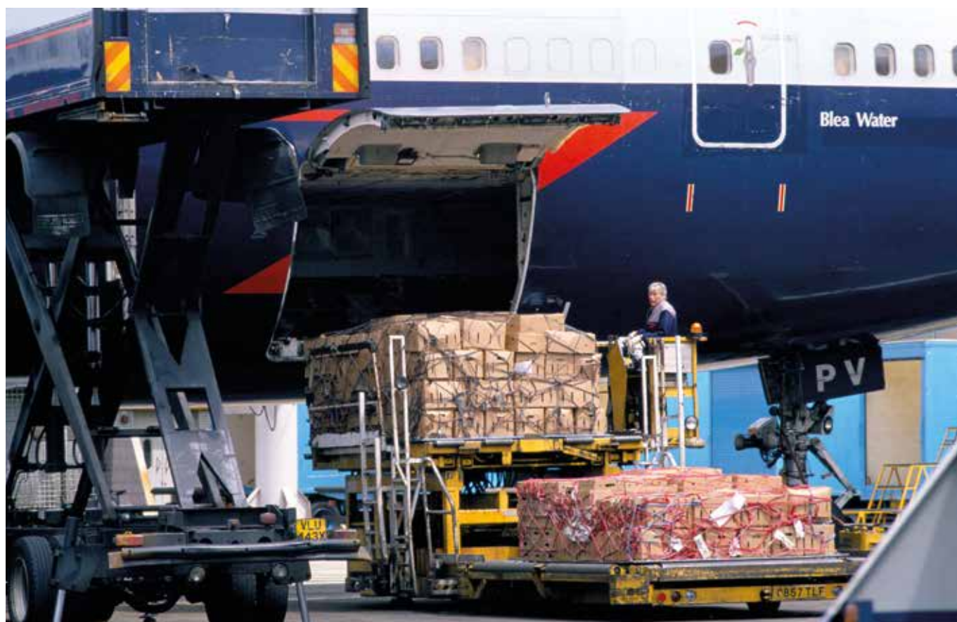
Figure 12: Loading cargo onto an aeroplane at Heathrow Airport.

the environment. As part of the Jet Zero consultation we set out the potential for future PSO routes to use SAF or zero emission technologies.