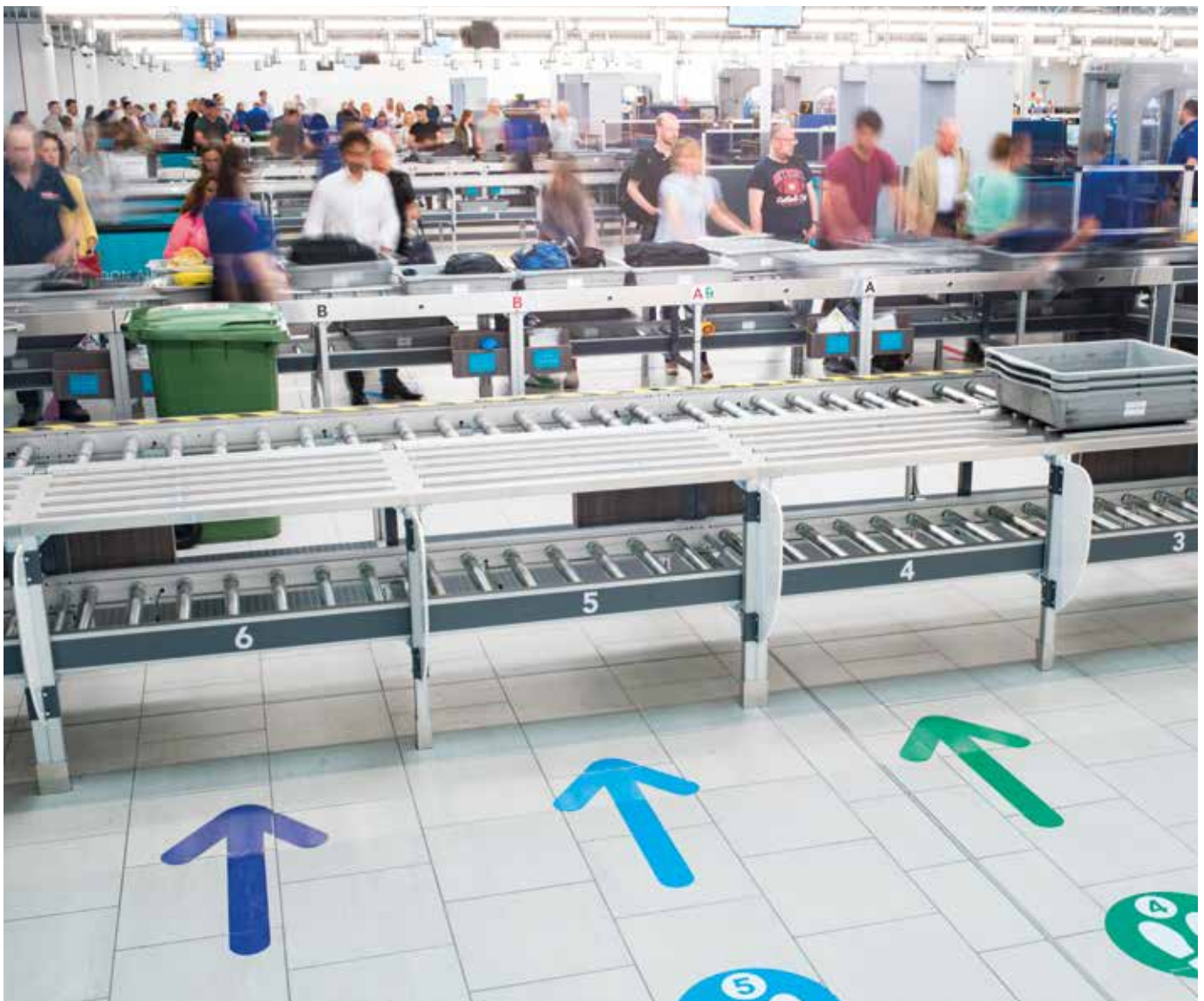
Figure 19: Passengers at North Terminal security lanes, Gatwick Airport.

The Government is also in the process of refreshing its Aviation Security Strategy to ensure it builds on and fully encompasses the broad range of work being done across the