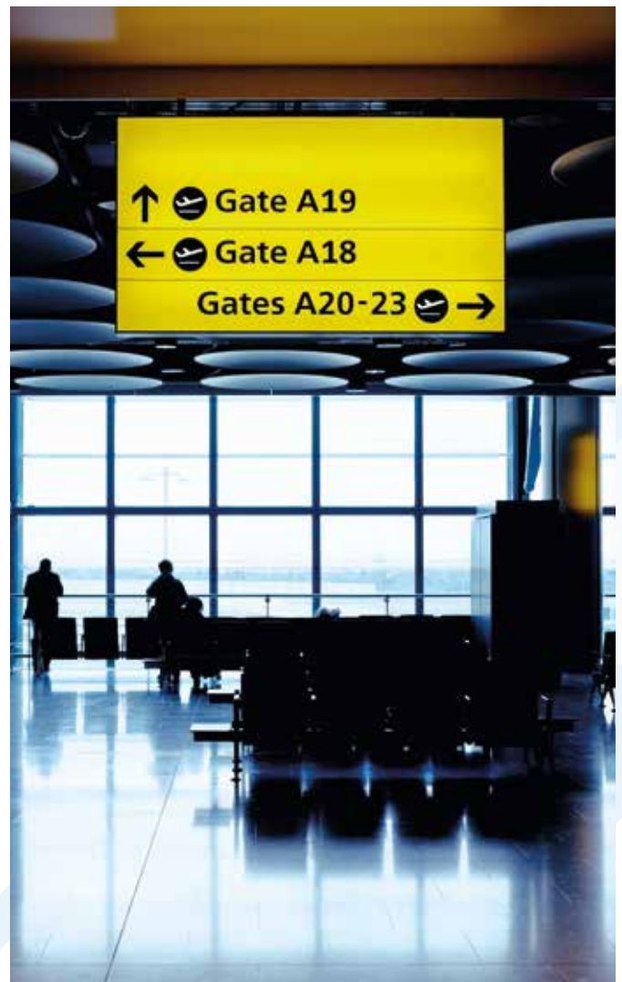
Figure 1: Passengers at an airport boarding gate.

After the transition period ended, full alleviation from the slot rules was maintained for the summer 2021 season. We then took advantage of the UK's exit from the EU to introduce new powers, in the Air Traffic Management and Unmanned Aircraft Act 2021, to allow more flexible alleviation measures to help the sector during the pandemic.