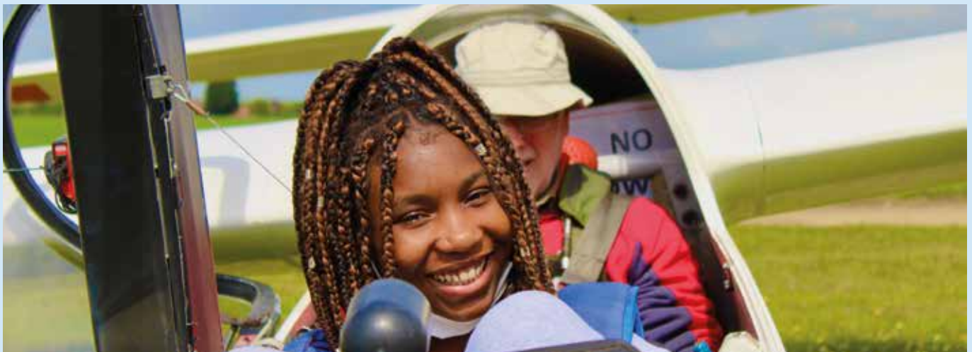
Figure 13: The Air League

On completion of the Soaring to Success programme, 70% of participants have an increased awareness of career opportunities in aviation. In addition, at least 70% of education professionals participating in the Air Experience days have an increased understanding and awareness of career opportunities within aviation which will help them to better communicate opportunities within aviation to those they work with. Soaring to Success demonstrates the high-level impact of outreach partner activities resulting in an increased awareness of careers within aviation.