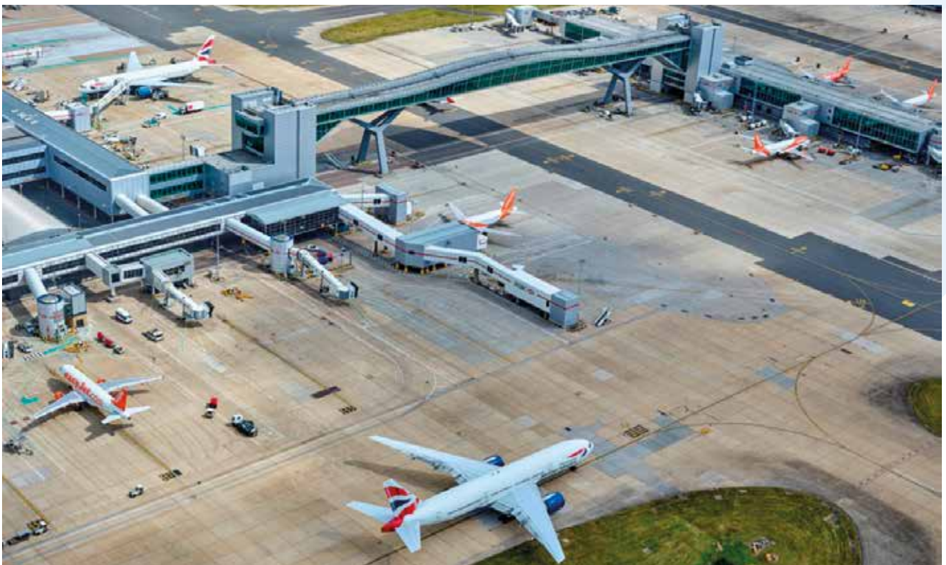
Figure 8: Several aircraft at airport terminal, Gatwick Airport.