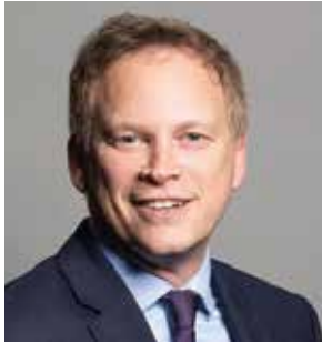
Grant Shapps Secretary of State for Transport