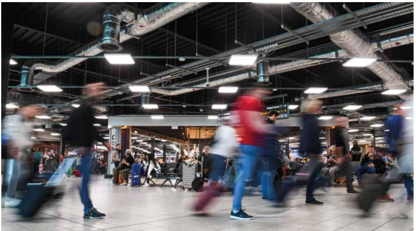
Figure 4: Passengers travelling through a terminal, London Luton Airport.

As the sector recovers, it is also important to recognise the vast opportunities available to the UK through trade and investment. Aviation continues to play a key role in supporting the Government's economic growth agenda. As we build back better, we will make the most of UK aviation strengths, leadership and competitive advantage to support the Government's ambition to incentivise UK trade and investment opportunities as set out in the Government's 'Race for a Trillion' refreshed export strategy. This includes aviation supporting the Government's ambition to achieve £1 trillion in exports annually by the mid-2030s. Aviation can help boost UK trade opportunities in a number of ways: