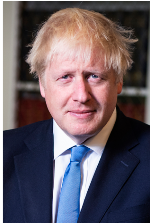
PRIME MINISTER OF THE UNITED KINGDOM