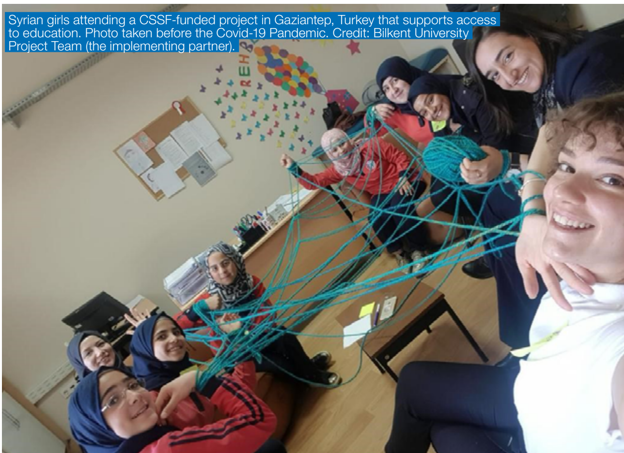
Syrian girls attending a CSSF-funded project in Gaziantep, Turkey that supports access to education. Photo taken before the Covid-19 Pandemic.

In Turkey, the CSSF is funding a university-led action research project to improve the integration of Syrian girls into Turkey's education system. As well as supporting broader social cohesion between the local and refugee communities, this project addresses the specific challenges girls face such as dropouts and