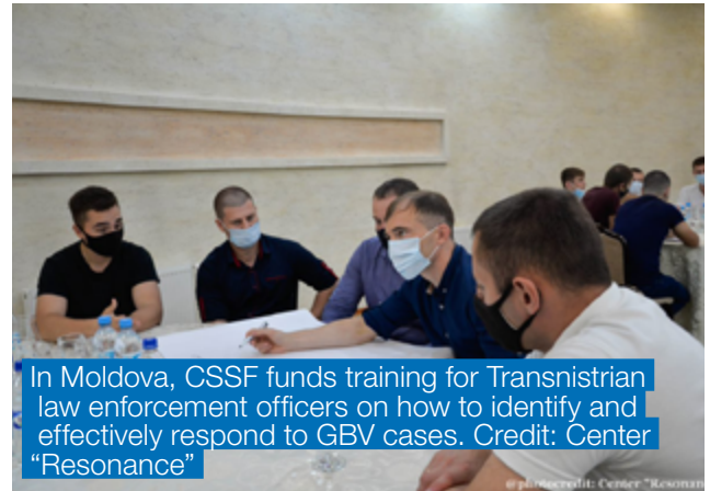
In Moldova, CSSF funds training for Transnistrian law enforcement officers on how to identify and effectively respond to GBV cases.

Since the outbreak of the pandemic, all types of violence against women, particularly domestic violence, have increased, as outlined by UN Women in their publication, The Shadow Pandemic: Violence against women during COVID-19 . 3 This development highlighted the importance of the UK Government’s commitment to gender equality, as COVID-19 posed new risks and exacerbated existing harms for women