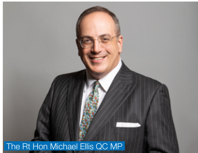
The Rt Hon Michael Ellis QC MP

For example, in Ukraine, the CSSF enabled an integrated approach, drawing together different UK Government departments across defence, security, diplomacy and development to support Ukraine in countering the full range of Russian hybrid threats, including propaganda and disinformation. In Colombia, CSSF projects on countering environmental crime leveraged funding from the Colombian national budget and the UK's International Climate Fund. In Somalia, the Fund's high-risk appetite enabled the UK to be the only donor working directly with the Somalia National Army and the African Union Mission in Somalia to enhance civil-military coordination and to improve community reconciliation in areas of Somalia recently recovered from al-Shabaab occupation.