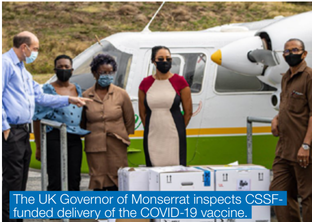
The UK Governor of Monserrat inspects CSSF-funded delivery of the COVID-19 vaccine.

between UK Government departments and agencies and the wider international community to support efforts to address vaccine hesitancy.