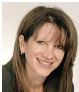
Rt Hon Theresa May MP Home Secretary and Minister for Women and Equalities

A handwritten signature in black ink, appearing to read 'Lynne Featherstone'.