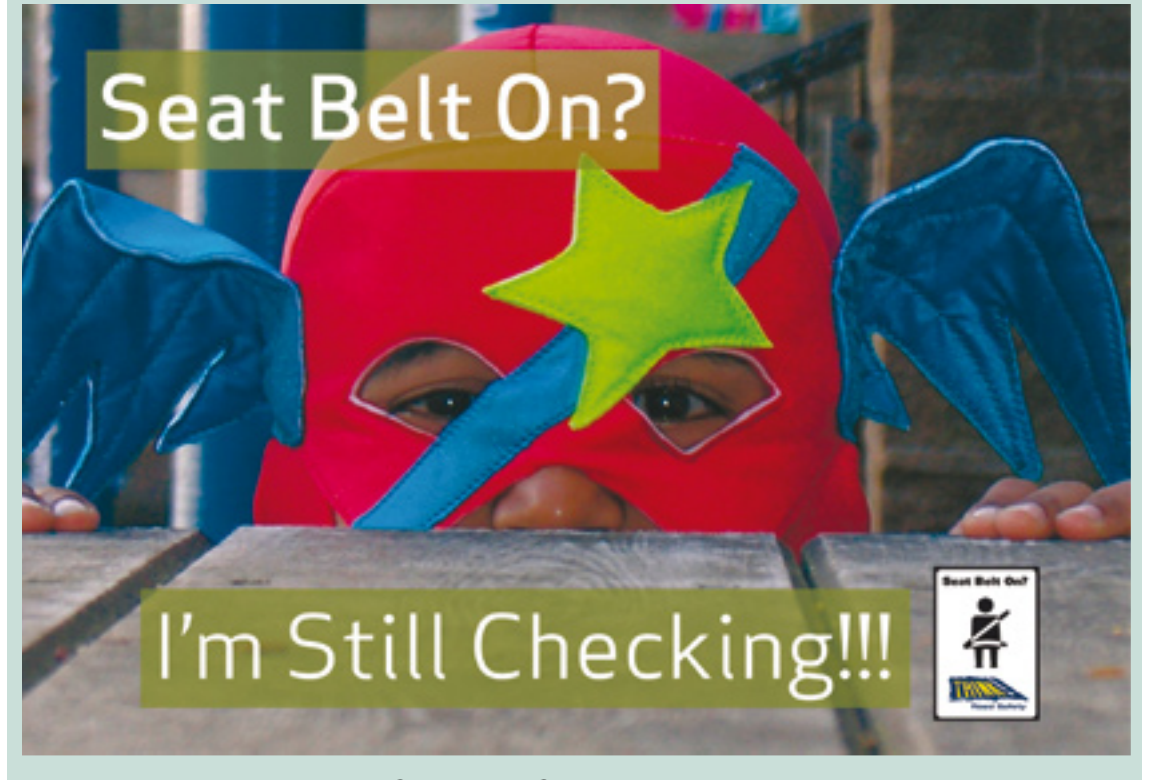
Figure 5.1b: Example of Seat Belt Superhero message