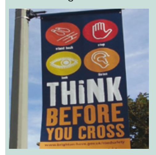
Figure 6.1a: 'Think before you cross' campaign banner