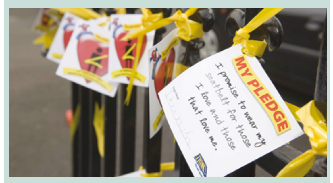
Figure 5.1a: Yellow Ribbon Day