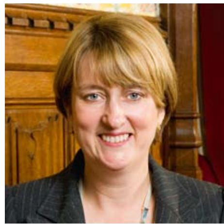
Hazel Blears, Secretary of State for Communities and Local Government

A handwritten signature in black ink that reads "Jacqui Smith".