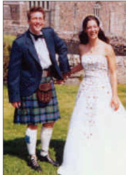
A trans man and his bride

Gender dissonance is sometimes evidenced from an early age by, for instance, non-stereotypical choices of dress and leisure pursuits. Phenotypically female children may refuse to wear dresses, and phenotypically male children may be drawn to flowery, girlish clothes. They may 'borrow' clothes from their mother or their sister.