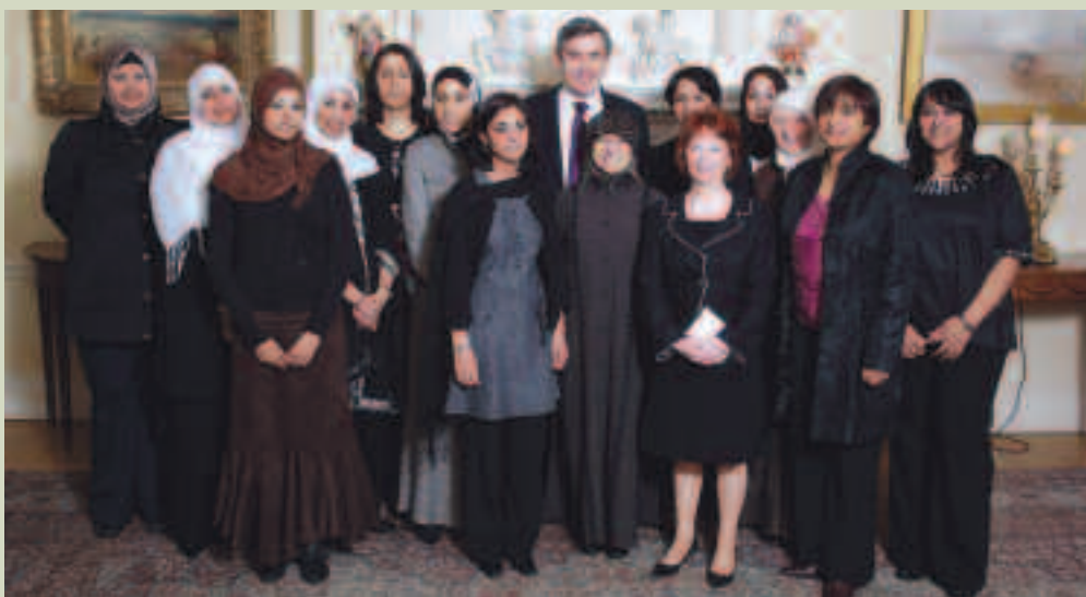
January 2008 launch of the National Muslim Women's Advisory Group.