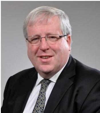
The Rt. Hon Patrick McLoughlin MP Secretary of State for Transport

The 'High Speed East and West: The next steps to Crewe and beyond' command paper, also published today, sets out: the route decision on Phase 2a between the West Midlands and Crewe; the Government's latest thinking for the rest of the "Y" network; how HS2 will be part of our existing rail network; and how HS2 is an integral part of our plans for the Northern Powerhouse. The Government's aim is to announce a route decision for the rest of Phase 2 in autumn 2016.