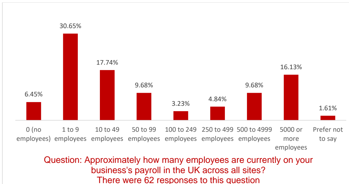
Figure 4. Number of UK employees per business