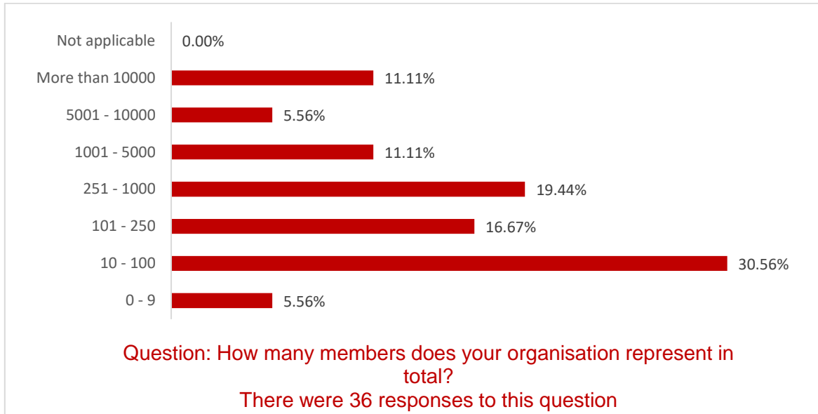
Figure 5. Proportion of businesses the business associations represent