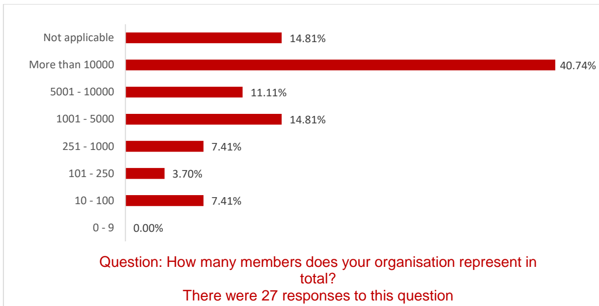
Figure 3. Total number of members that the NGO represents