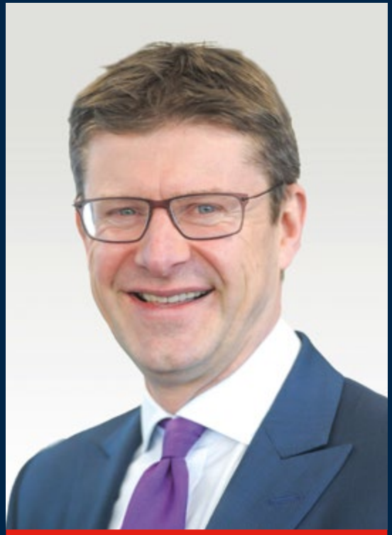
Rt Hon Greg Clark MP

This Sector Deal will benefit the entire UK aerospace community, companies both large and small, in all parts of the UK. It is a commitment by the sector to work collectively, with support from the government, to deliver the industrial strategy, and to drive clean growth and the future of mobility in the economy.