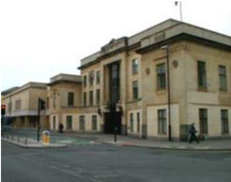
Oxford Combined Court