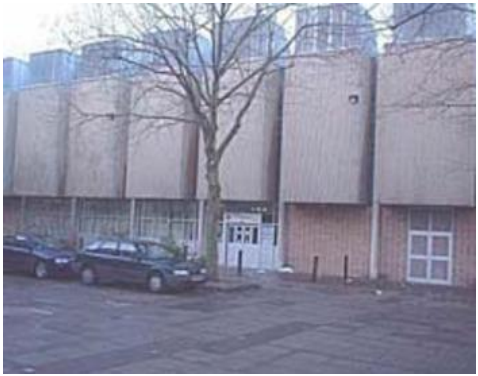
Oxford Magistrates' Court

These courts are adjacent buildings within yards of each other. Courtroom capacity was increased by two courtrooms in 2017 to enable the closure of Bicester Magistrates' Court. Oxford Magistrates' Court was built in the early 1970s and is Equality Act Compliant. Roof repairs are required and are being taken forward.